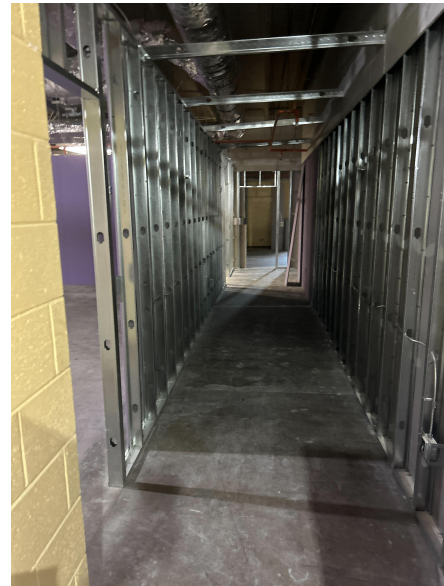
Stud wall framing in classrooms on Level 2.