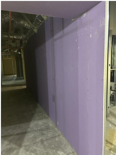
One-sided drywall installation on Level 2.