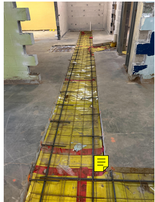
Plumbing trench pour back preparation on Level 1.