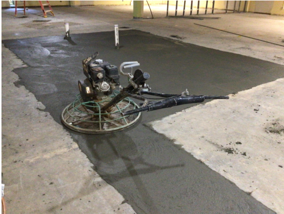
Plumbing trench pour back on Level 1.